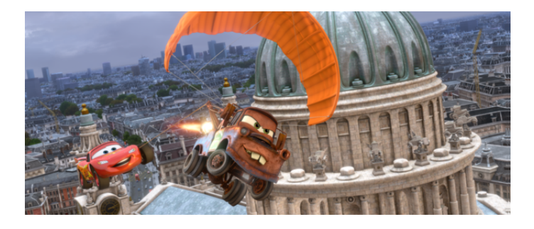
Figure 2.2: CityEngine in CARS 2

was used in a car chase scene in the film CARS 2 [PROCEDURAL Inc. 2011].