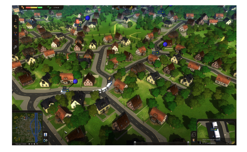
Figure 2.3: Cities in Motion

cally inside the game network like depending on the modification of the terrain allowing the user to put city elements like road and buildings accordingly and restrict from the areas where elements can not be positioned and so on. This is not a very new concept. It has been used in games like SIMCITY which was first released in 1989 and has grown in popular since. In April 2011, Paradox Interactive released a building simulation game titled Cities In Motion which uses the same technique. Additionally the user has implement and improve a public transport system in European cities. Here, most of the computations are done procedurally yet the user has very high level of control for the creation of the city which makes the game-play interesting and entertaining [PARADOX INTERACTIVE 2011].