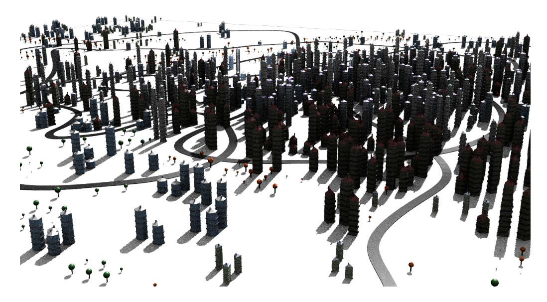
Figure 5.2: With Original Geometries