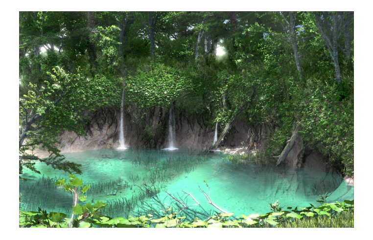
Figure 2.1: SpeedTree Cinema