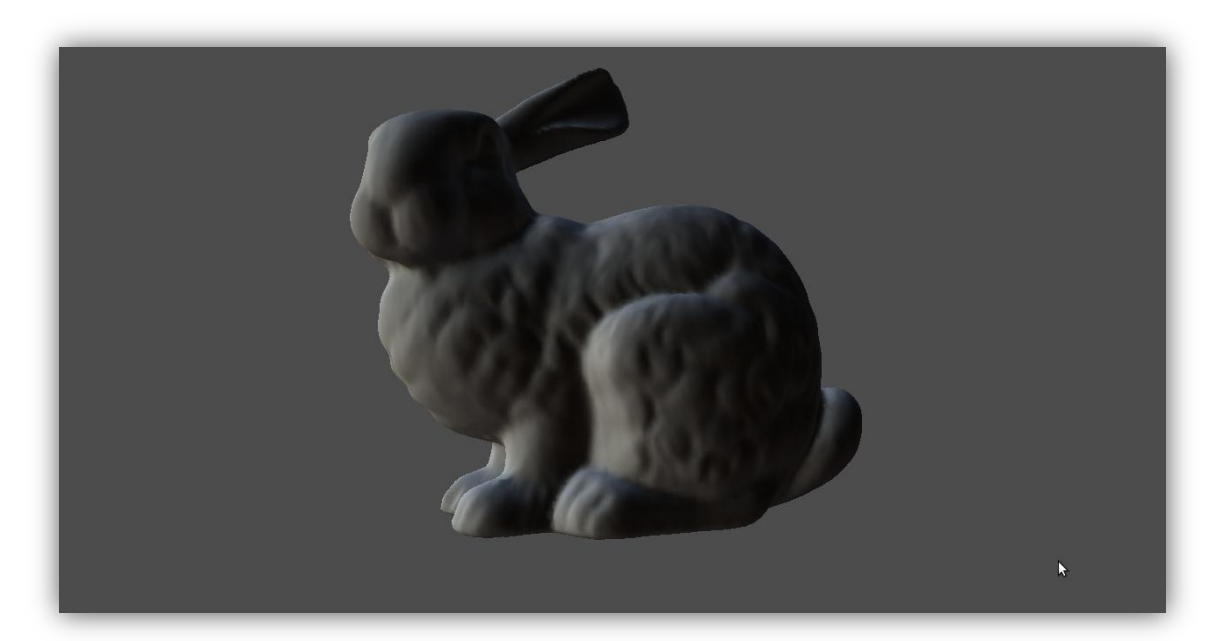
Figure 4.2: Rendering example: The Stanford Bunny lit by spherical harmonics based lighting. The light probe used is Paul Debevec's "beach_cross". 100000 samples and 3 bands were used.

The shader handles the reconstruction of the image from the SH coefficients passed to it. This is based on the reconstruction given by Ramamoorthi et al in (9). The shader in use is based off a shader at Rendering Wonders [RWND] which in turn is based off Ramamoorthi's design (9). The shader requires a number of variables, such as the harmonic coefficients and gain. It also allows for control of Ka, Kd and Ks but these are not implemented as yet.