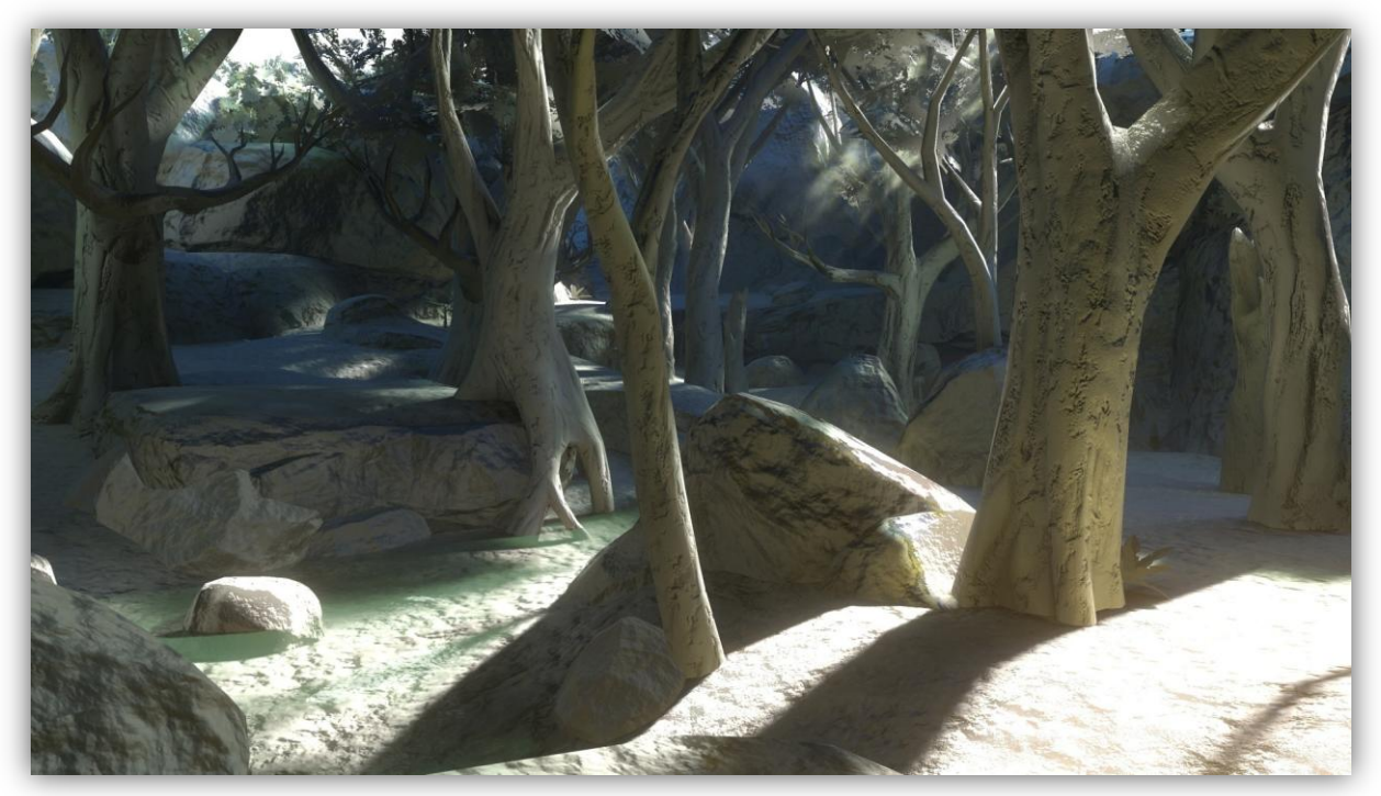
Figure 2.2: The directional diffuse lighting in Halo 3 is sampled in third order harmonics. Image courtesy of Hao Chen. [CHEN08]

Spherical harmonics have also been implemented in the Unreal engine, as a PRT method for a global illumination solver. Specifically, precomputed spherical harmonic sample volumes are used to calculate ambient occlusion, environment lighting, interreflections, and indirect lighting for dynamic objects. This was used for both occlusion and environment lighting in Mirror's Edge, pre-baked using Autodesk's "Beast" lighting engine [WFIRE11].