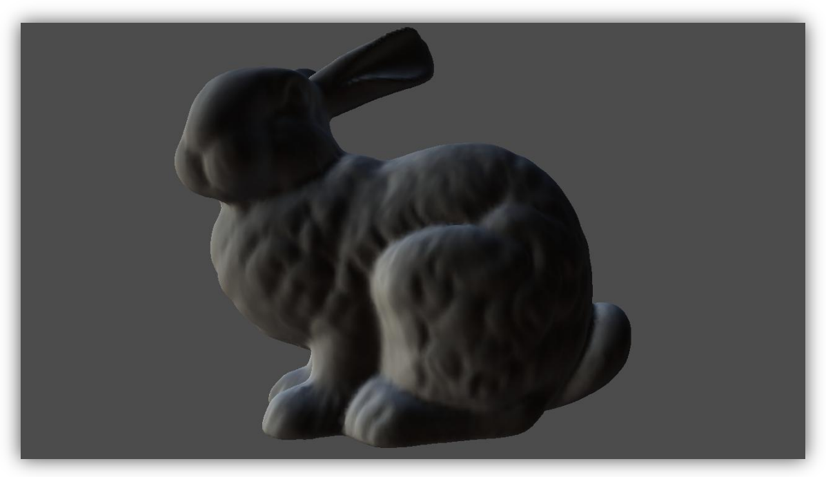
Figure 5.3: The Stanford Bunny rendered with 1000 samples.