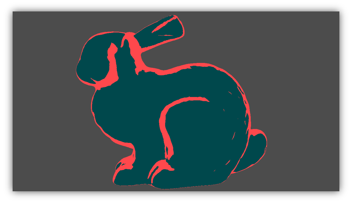
Figure 5.5: The Stanford Bunny rendered with 10000 samples but only one band.

The number of bands affects the quality of the image as it limits the number of coefficients available. The term "band" is interchangeable with the "order" of harmonics. Figure 5.5 shows image created with only one band. Image quality increases along with the number of bands, due to the number of resulting coefficients, though this is merely a margin of accuracy. This implementation requires only three bands for the resulting nine coefficients. Image quality will noticeably be adversely affected by a number of bands lower than three.