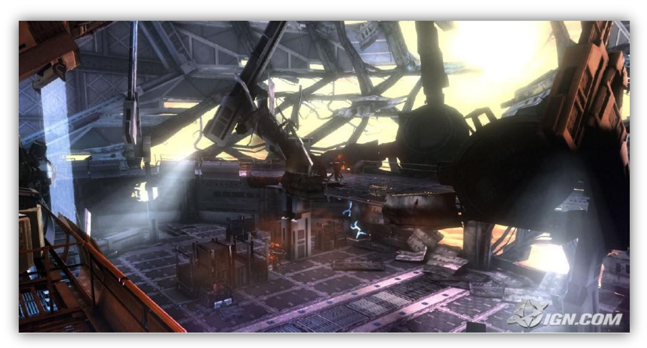
Figure 2.1: The lighting solution in Killzone 2 incorporates second order spherical harmonics allowing for fast ambient lighting. [IGNKZ2]

Spherical harmonics are very efficient data structures, and the greatest efficiency is required in video games, where cycles are at a premium, yet image quality still remains sought after. As such, the focus of the project moved to the exploration of the uses of spherical harmonics in games such as Killzone 2 and Halo 3.