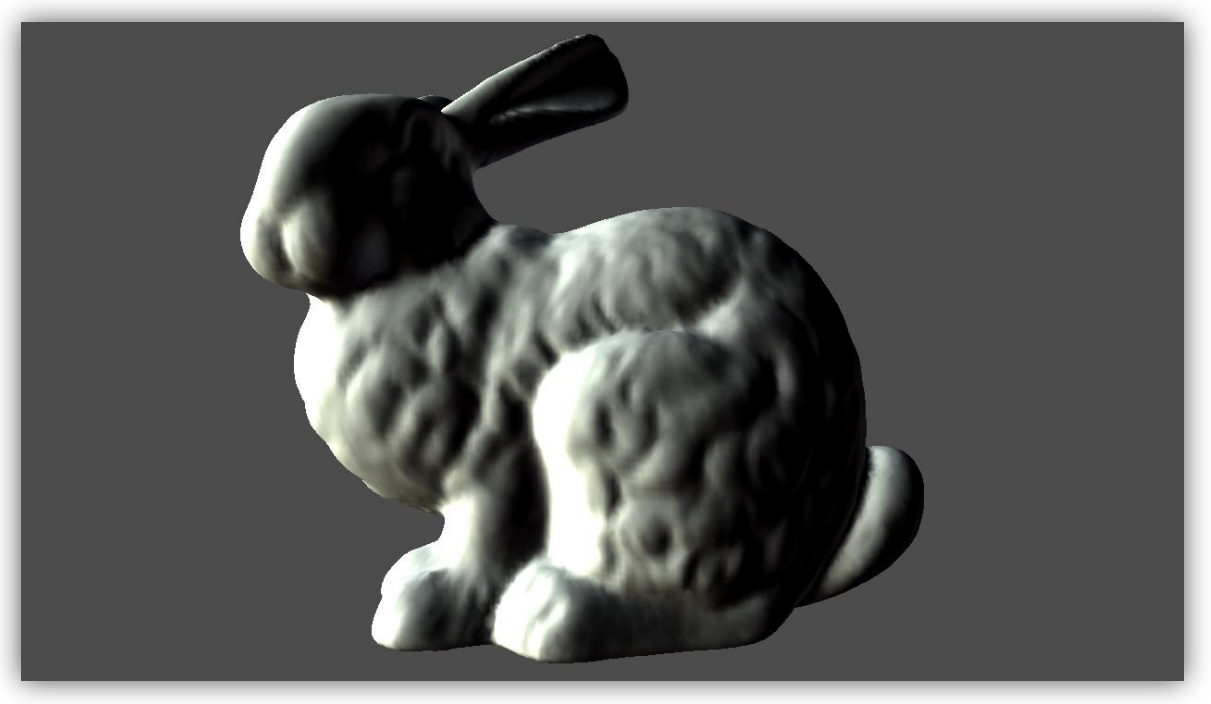
Figure 5.1: The Stanford Bunny rendered with only 10 samples.

The application created does render images based on a number of vertical cross format .hdr files courtesy of Paul Debevec. The spherical harmonics return different results when different sample numbers are used, as this directly affects the accuracy of the reproduction of the input image, as can be seen in Figures 5.1 to 5.4.