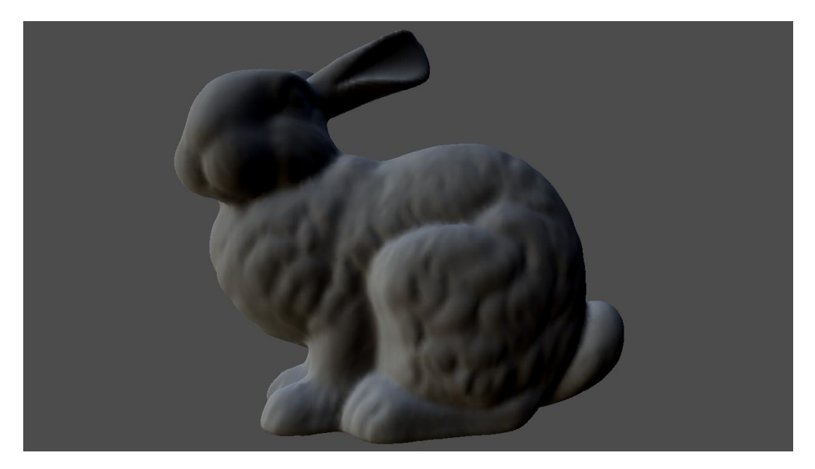
Figure 5.6: The Stanford Bunny rendered with 10000 samples and only 2 bands.

As can be seen in figure 5.5, shading errors appear as there is not enough information to properly reconstruct the surface. Errors also appear in figure 5.6 with a large yellow contribution appearing from an incorrect direction.